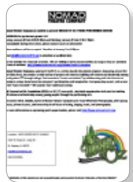
Wizard of Oz Auditions