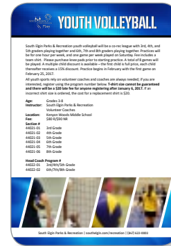
South Elgin Youth Volleyball Flyer