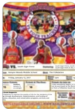
FUNDation Harlem Wizards Game