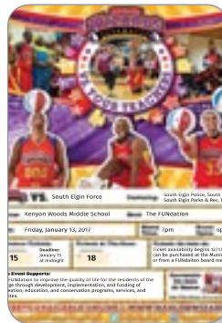
FUNDation Harlem Wizards Game