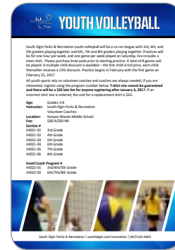
South Elgin Youth Volleyball Flyer