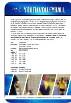
South Elgin Youth Volleyball Flyer