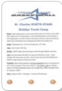
St. Charles North Youth Boys Basketball Camp