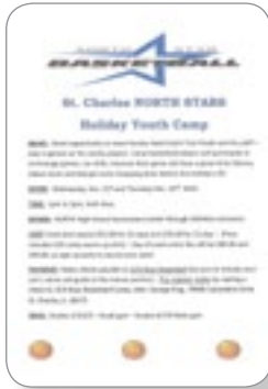
St. Charles North Youth Boys Basketball Camp