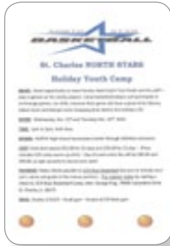
St. Charles North Youth Boys Basketball Camp