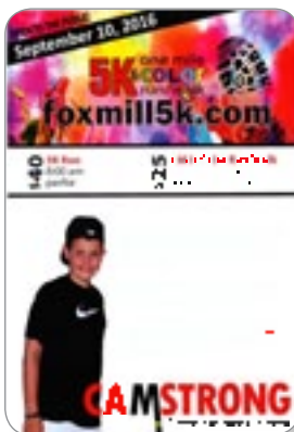
CamStrong One Mile & 5K Color Run/Walk