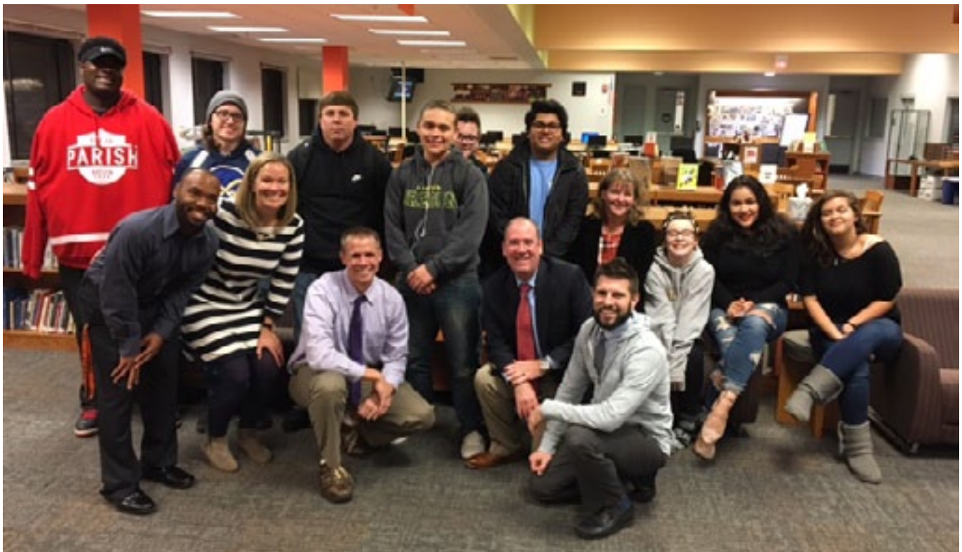
Students and staff of the District 303 Night School gathered for the first Night School Recognition Event on November 10.