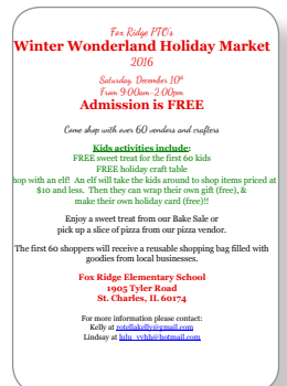
Fox Ridge Winter Wonderland Holiday Market