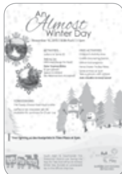
An Almost Winter Day