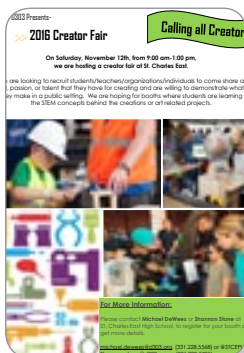
Calling All Creators