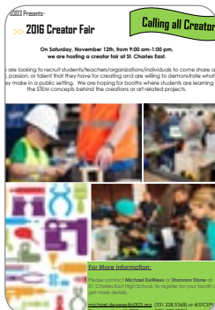
Calling All Creators