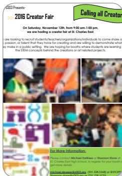
Calling All Creators