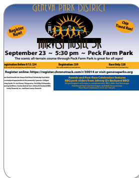
Harvest Hustle 5K