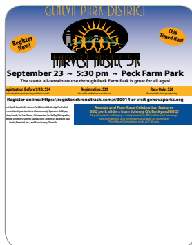
Harvest Hustle 5K