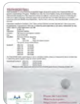
Youth Basketball League Registration Info