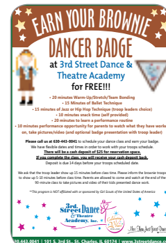
Free Dancer Badge Class for Brownie and Girl Scout Troops