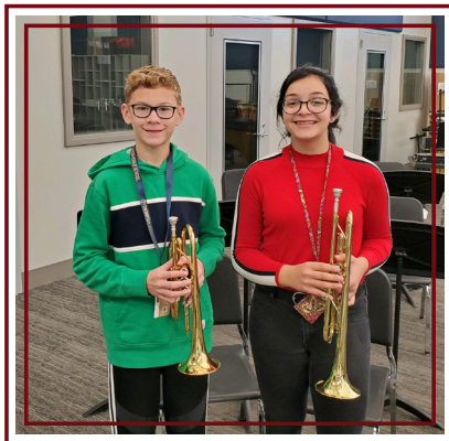
Thompson Middle School students, Concert Band and Jazz Band