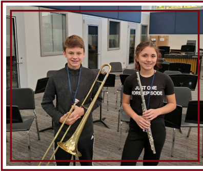
Thompson Middle School students, Concert Band and Jazz Band