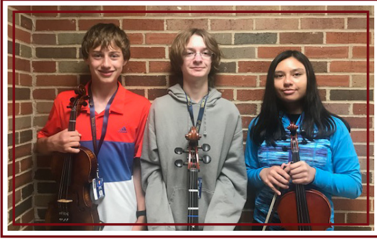
Thompson Middle School students, Orchestra