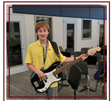
Thompson Middle School student, Jazz Band