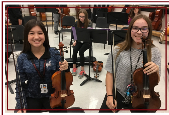
Wredling Middle School students, Orchestra

Wredling students create intricate and original jack-o-lanterns using power tools! Thanks to Wredling's PTO for supplying the pumpkins and D303 Facilities for delivering them.