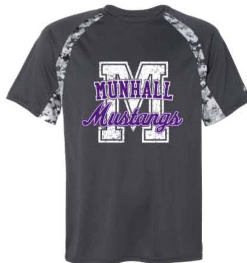
PERFORMANCE CAMO TEE $22 Youth & Adult Sizes