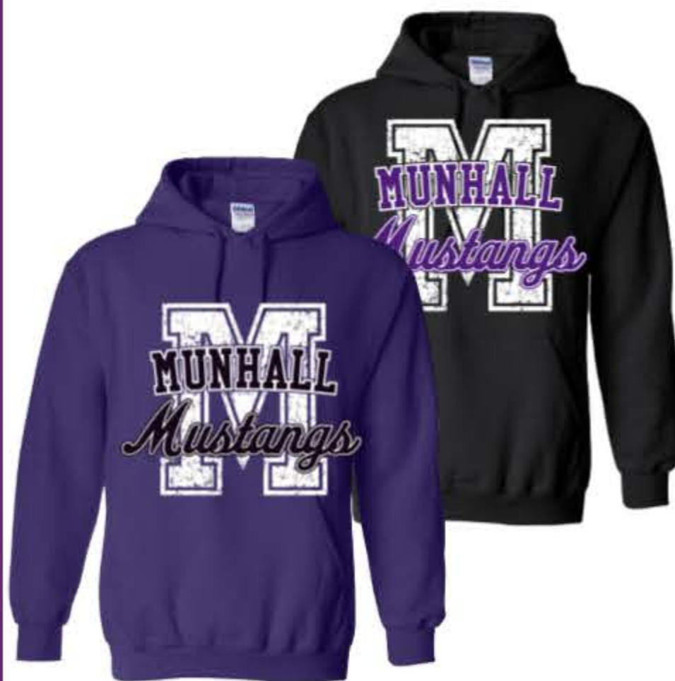
HOODED SWEATSHIRT $25 Youth & Adult Sizes