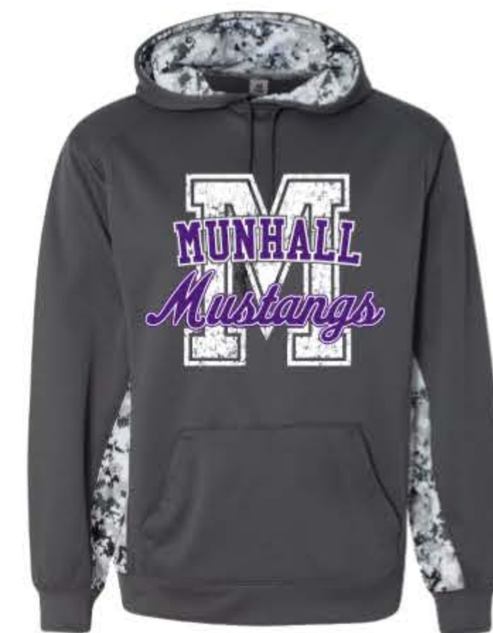
PERFORMANCE CAMO SWEATSHIRT $35 Youth & Adult Sizes