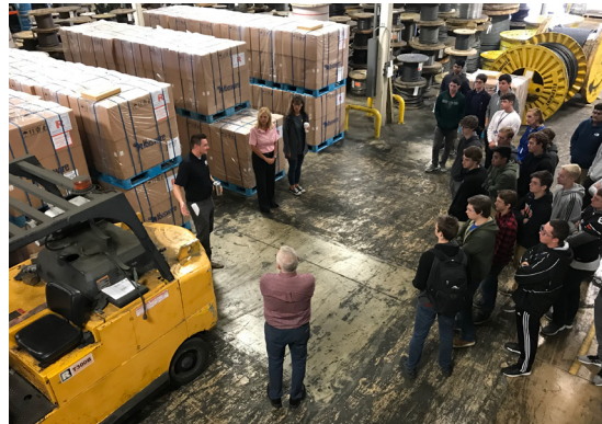
North students touring Alps Wire Rope Corporation.