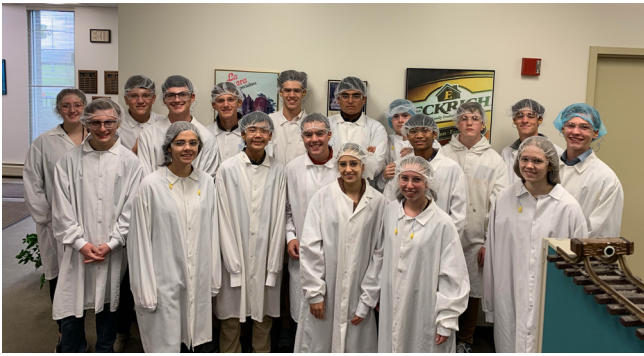
East students touring Smithfield were given hairnets, protective glasses, ear plugs, and food hygiene coats to enter the facility and learn about the process and packaging of sausages and meats.