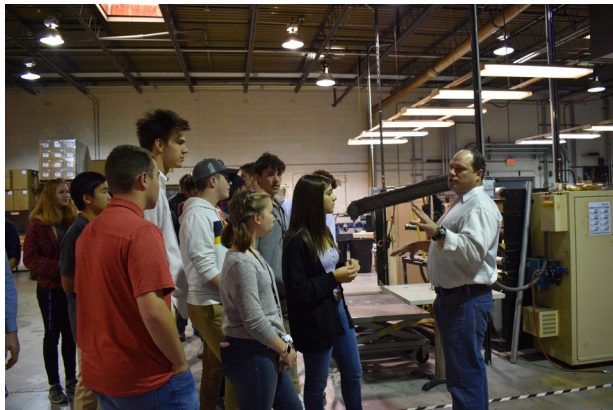
East students at Labels and Specialty Products learning about the design and printing process of labels and signs.

"You don't see how ropes are made but you see ropes in the applications of real life and seeing the behind the scenes is cool." -Ava, aspiring engineer