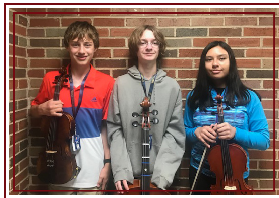
Thompson Middle School students, Orchestra