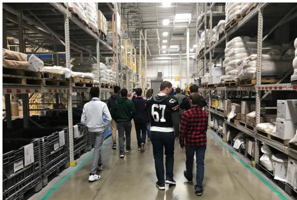
North students touring TIGER Drylac, one of the first companies to enter the previously unknown field of powder coating technology (which is used in automobiles, appliances, furniture, and sports equipment).