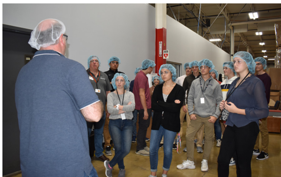
East students were given hairnets and protective glasses before touring Olcott Plastics, a plant that operates 24-hours a day producing plastic jars and caps.