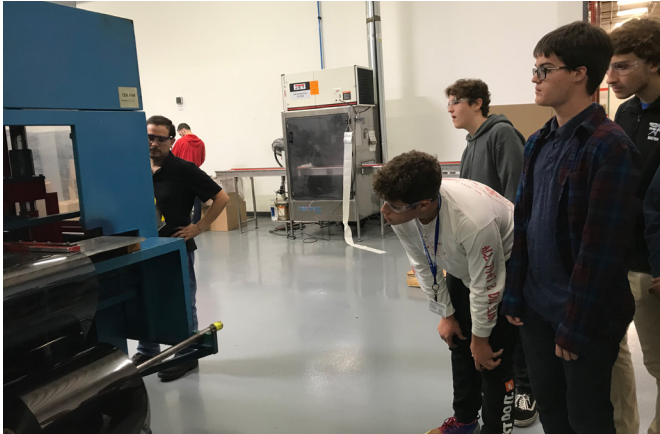
North students at Tek Pak watched rolls of thermoform being fed into a heated machine that stamped out molds used for electronics, medical equipment, and food.