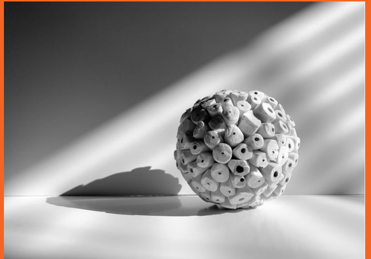
Aadit Shah 2nd Place Digital Photography