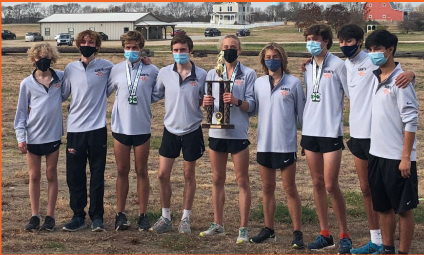
Boys Cross Country at the Shazam Racing State Championship - State Champs!