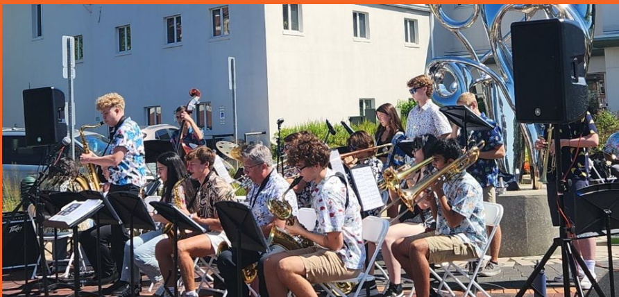
STCE Jazz Workshop performs at the City of St. Charles Jazz Weekend