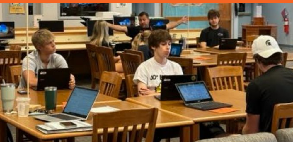
CCR Senior Meetings