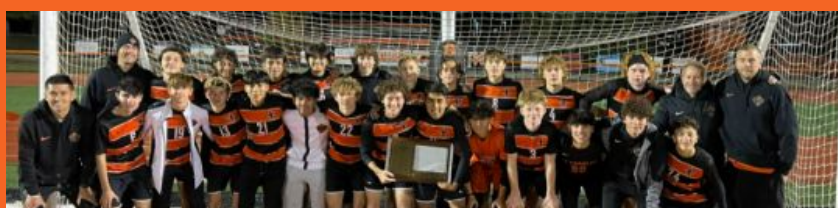
Boys Soccer - DuKane Conference Champions