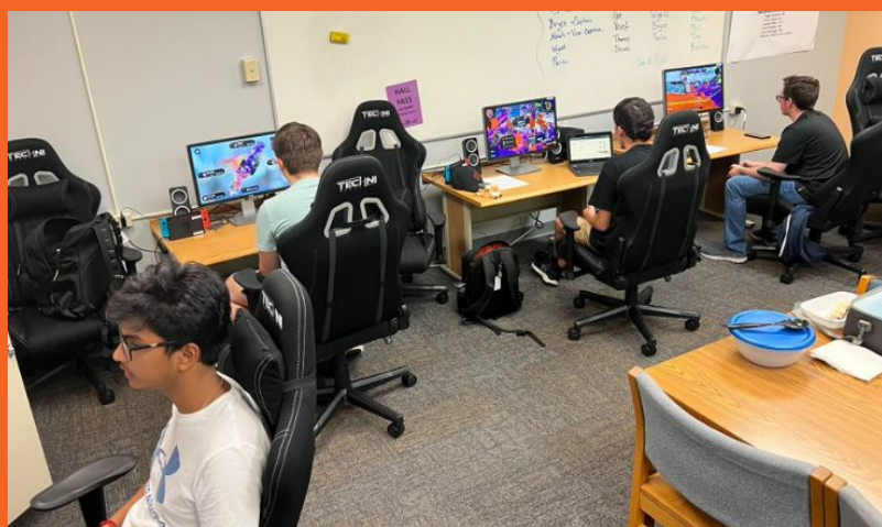
STCE e-Sports Team