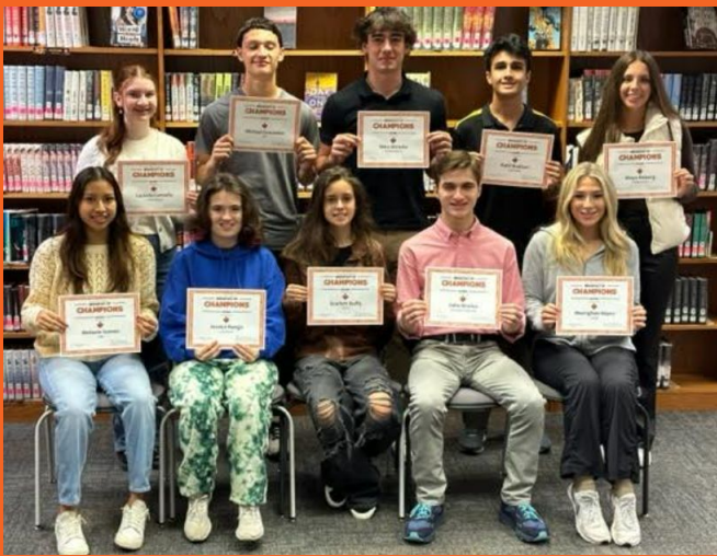
October 2023 Breakfast of Champions