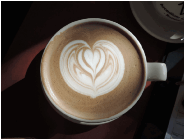
'Coffee' - Gerri Solomon, St. Charles North H.S. Digital Photography Instructor: Stephanie Dodd

Congratulations to St. Charles North students Machele and Gerri for having their photographs displayed in the Top 10 Photos from Week 1 of the ROE Photo Contest. Click here to view the other top photos.