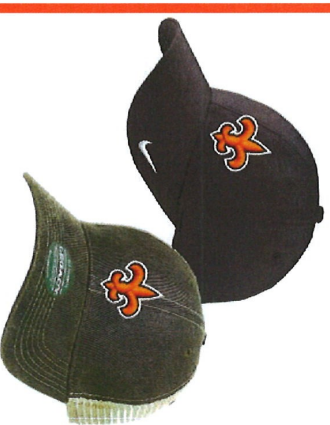
3D Fleur de Lis