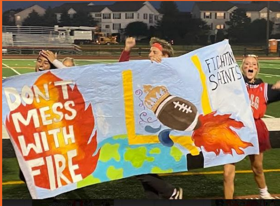
Senior Banner (above) and Drumline (Below) at the Small Games