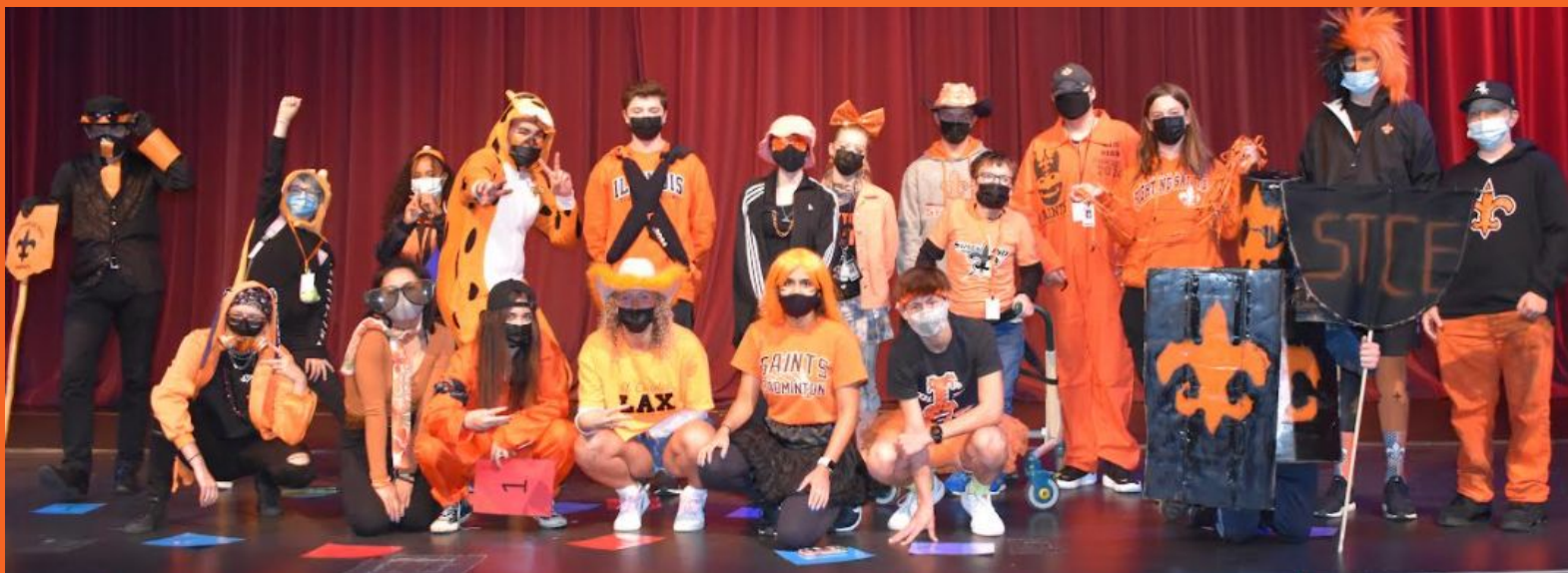
Orange and Black Competition Winners