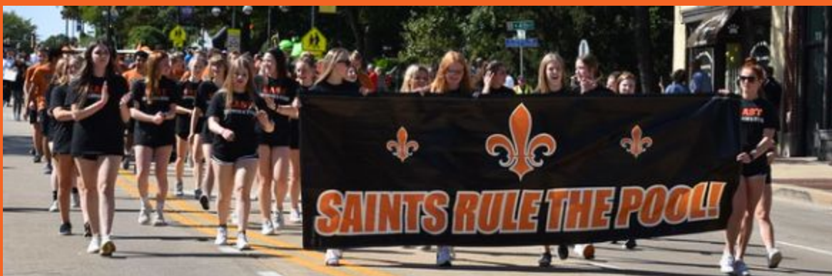
Girls Swim and Dive Team at the Homecoming Parade