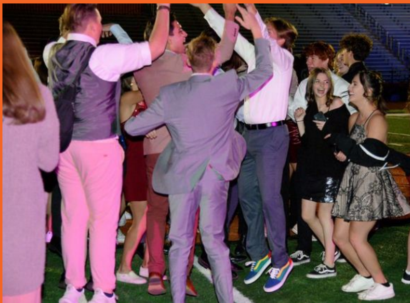
Candid shots from the Homecoming Dance