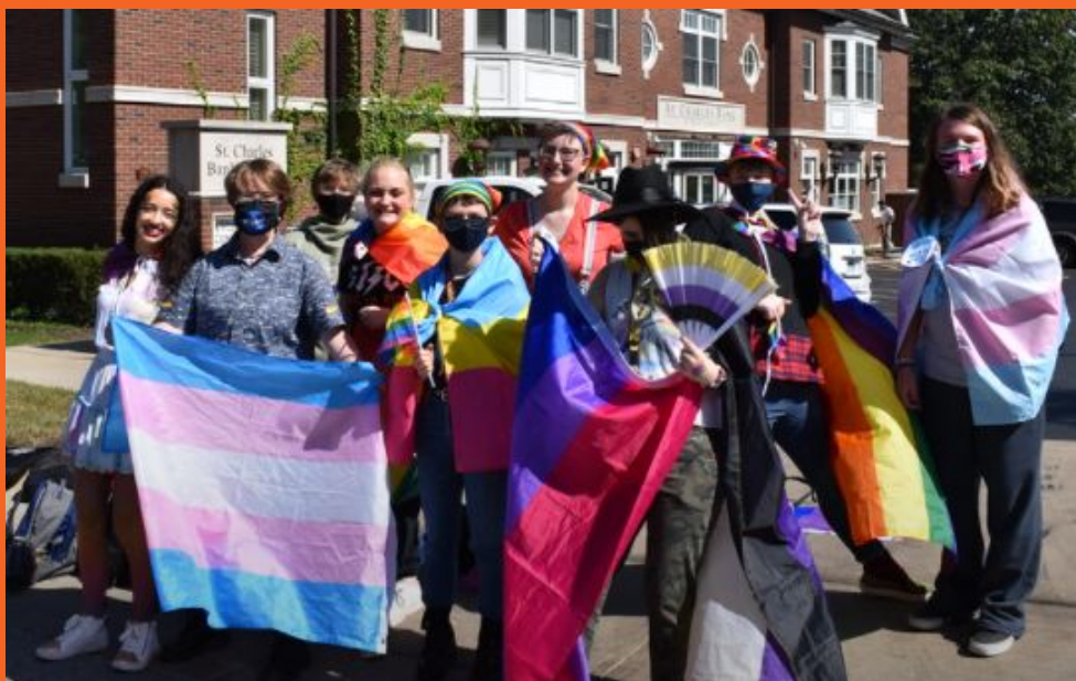
GSA at the Homecoming Parade