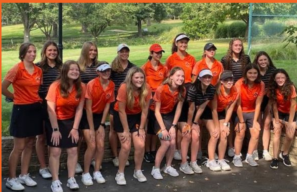
Girls Golf - State Qualifiers