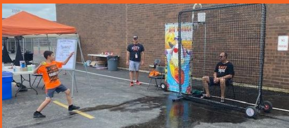
Saints Family Fun Fest