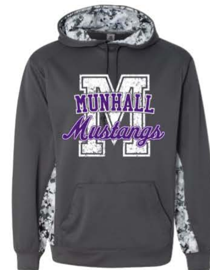
PERFORMANCE CAMO SWEATSHIRT $35 Youth & Adult Sizes