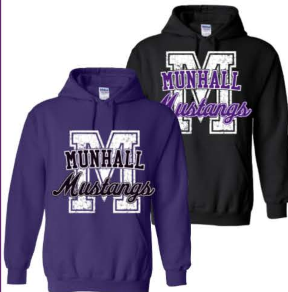
HOODED SWEATSHIRT $25 Youth & Adult Sizes