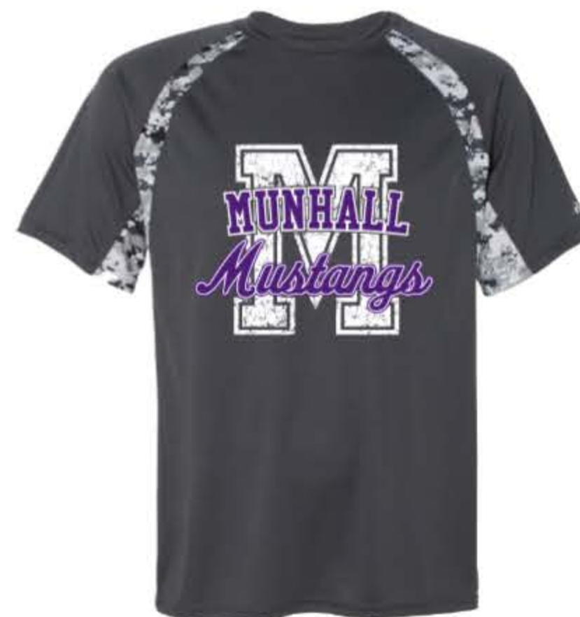
PERFORMANCE CAMO TEE $22 Youth & Adult Sizes