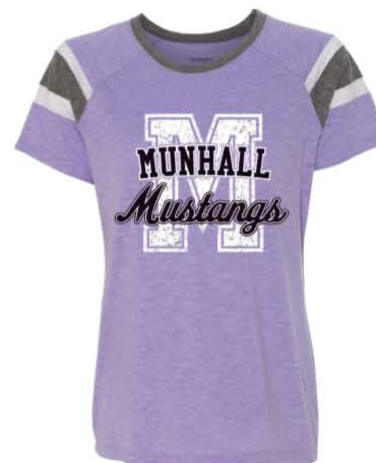
GIRLS & LADIES TEE $20 Girls & Ladies Sizes