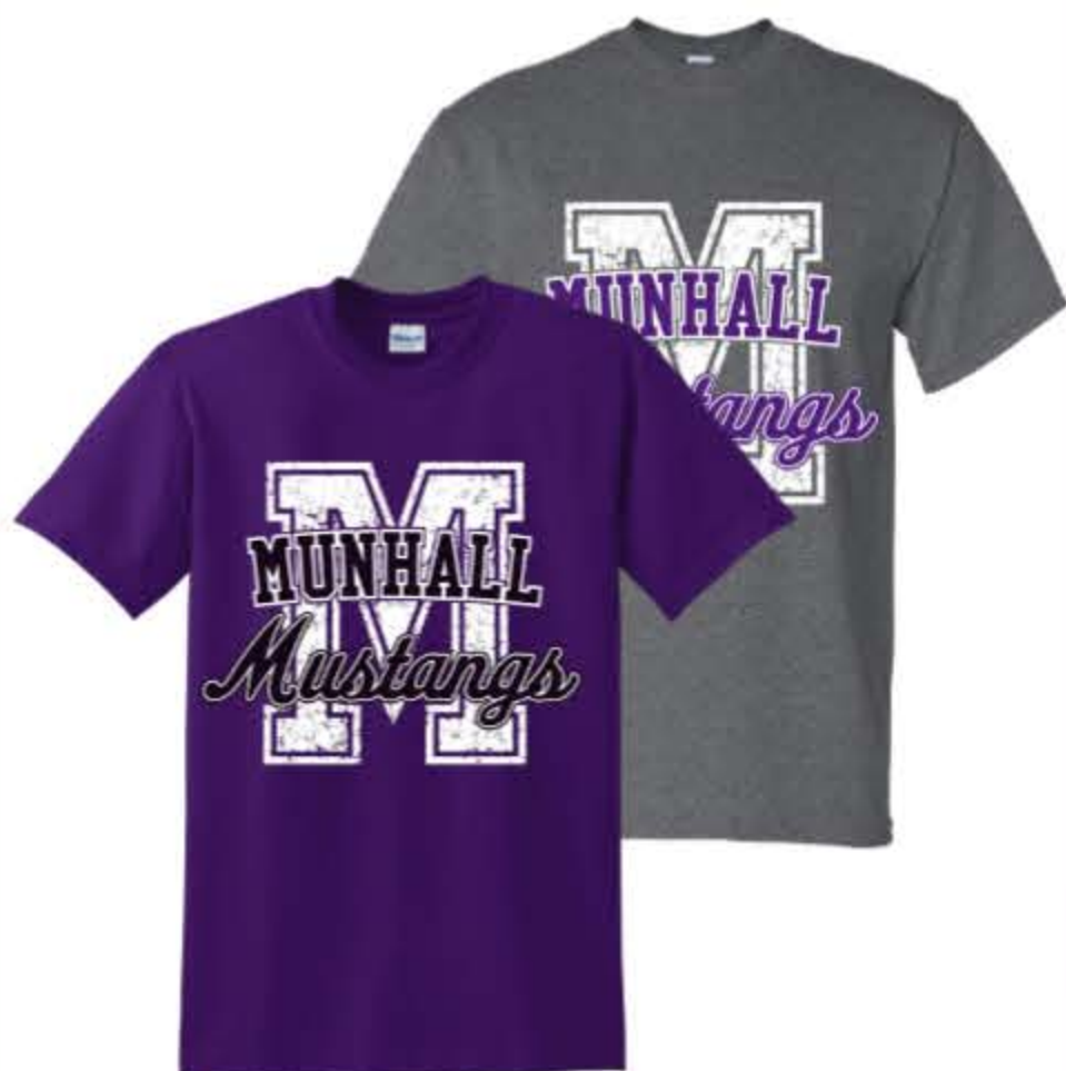
SHORT SLEEVE TEE $12 Youth & Adult Sizes