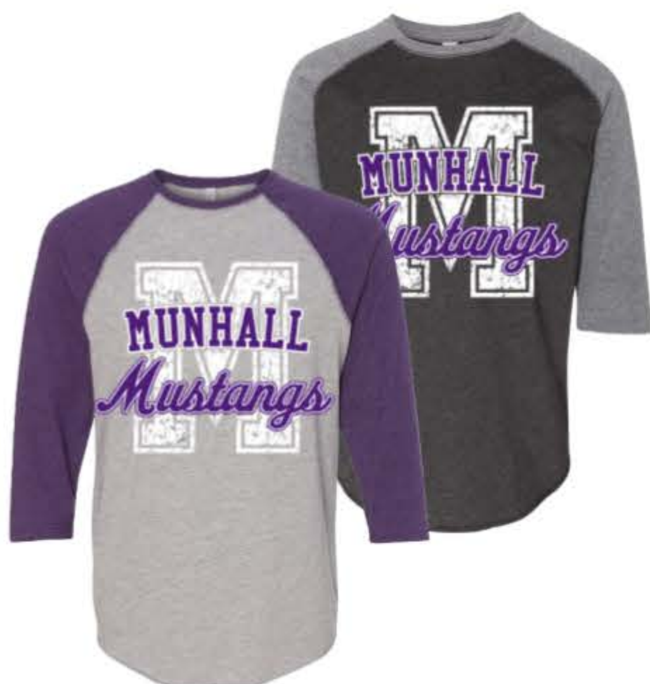
SHORT SLEEVE TEE $17 Youth & Adult Sizes