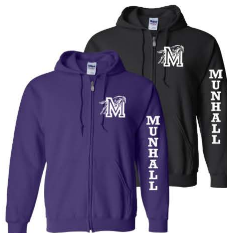
FULL ZIP SWEATSHIRT $30 Youth & Adult Sizes