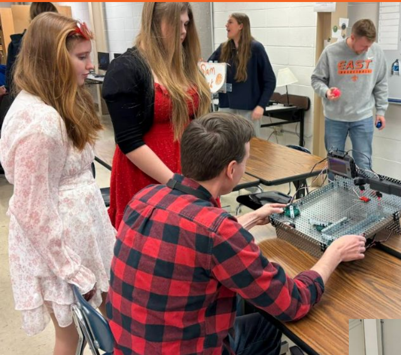
Project Lead the Way Principles of Engineering Arcades