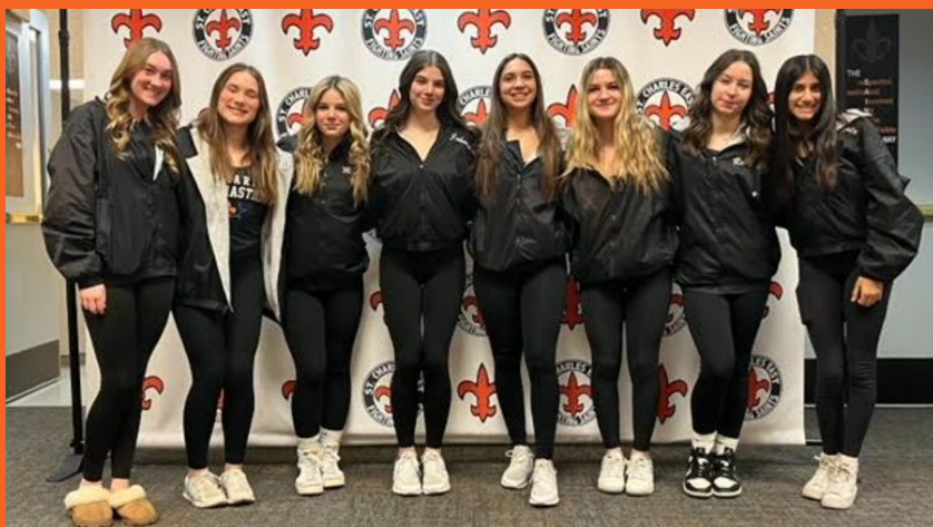
Gymnastics Send Off