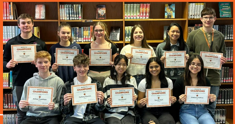
March Breakfast of Champions