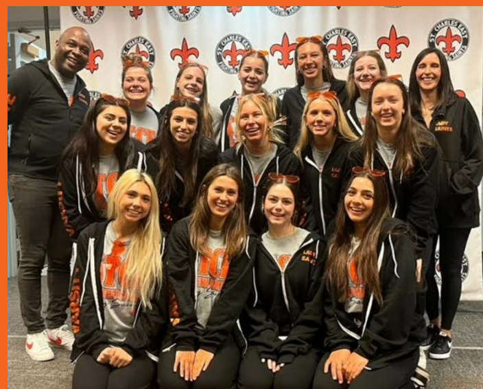
Cheer Send Off