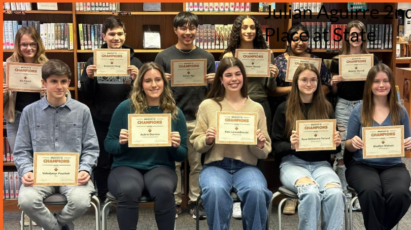
January Breakfast of Champions