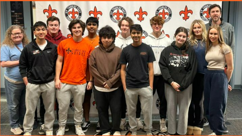
DECCA Send Off