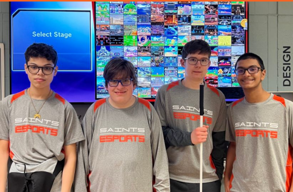
Saints eSports Super Smash Crew