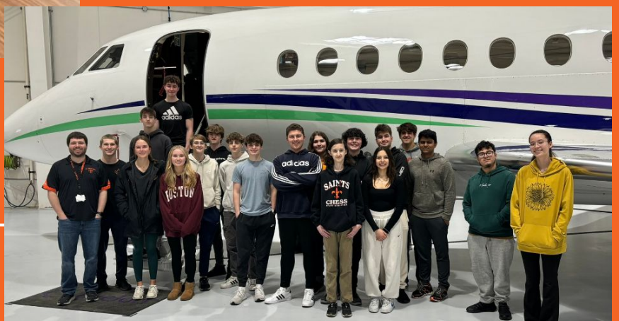
Project Lead the Way Aerospace Engineering Field Trip to the DuPage Airport