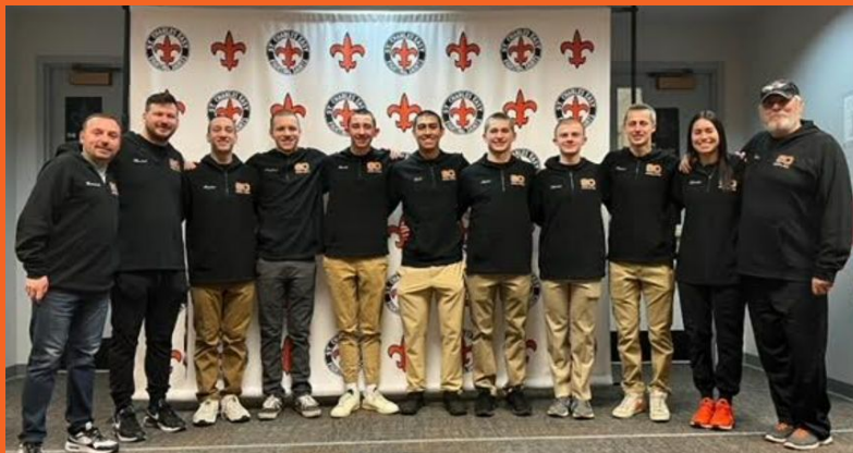
Boys Swim & Dive Send Off