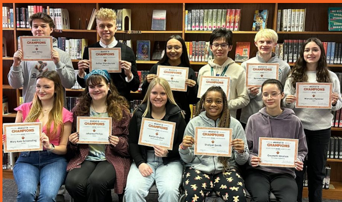
February Breakfast of Champions