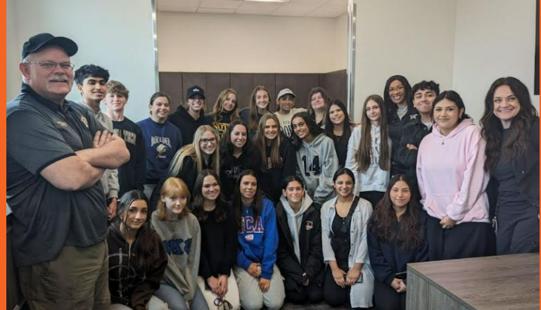
Advanced Healthcare Concepts Field Trip to the Kane County Coroner's Office