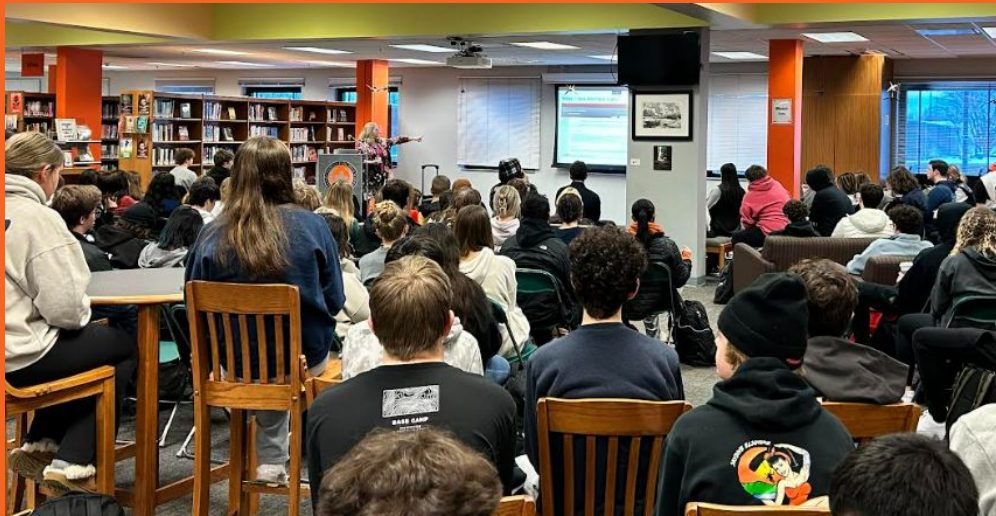
Kane County Clerk's Office presents to 11th and 12th grade students