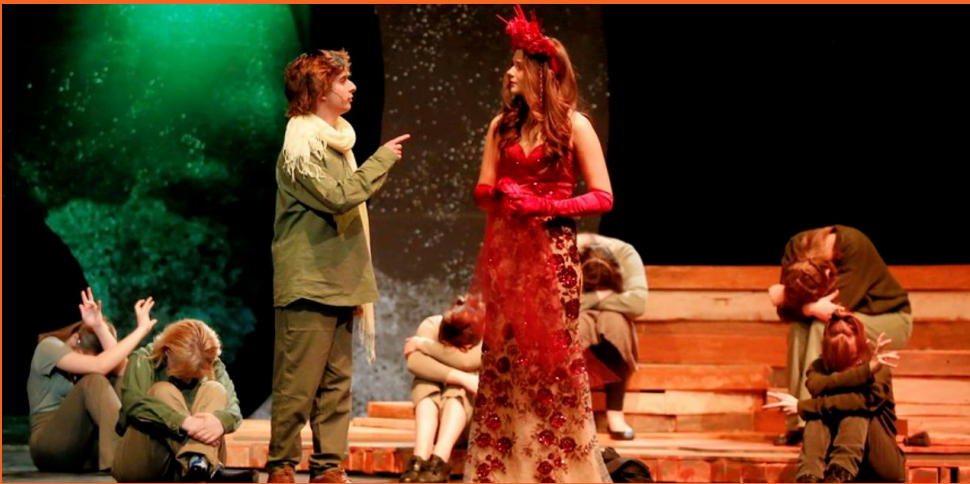
The Little Prince (above and right)