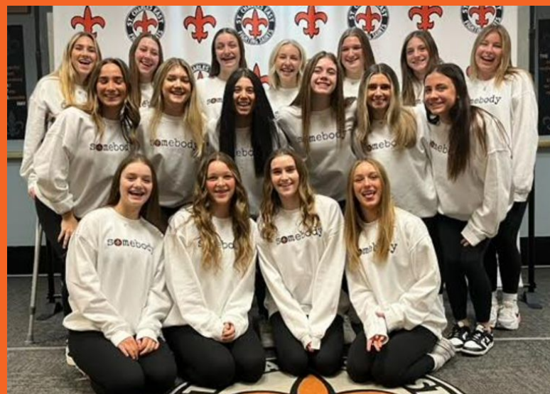
Dance Send Off