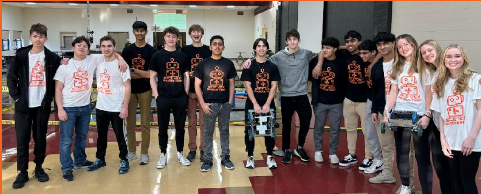
VEX Robotics Competition