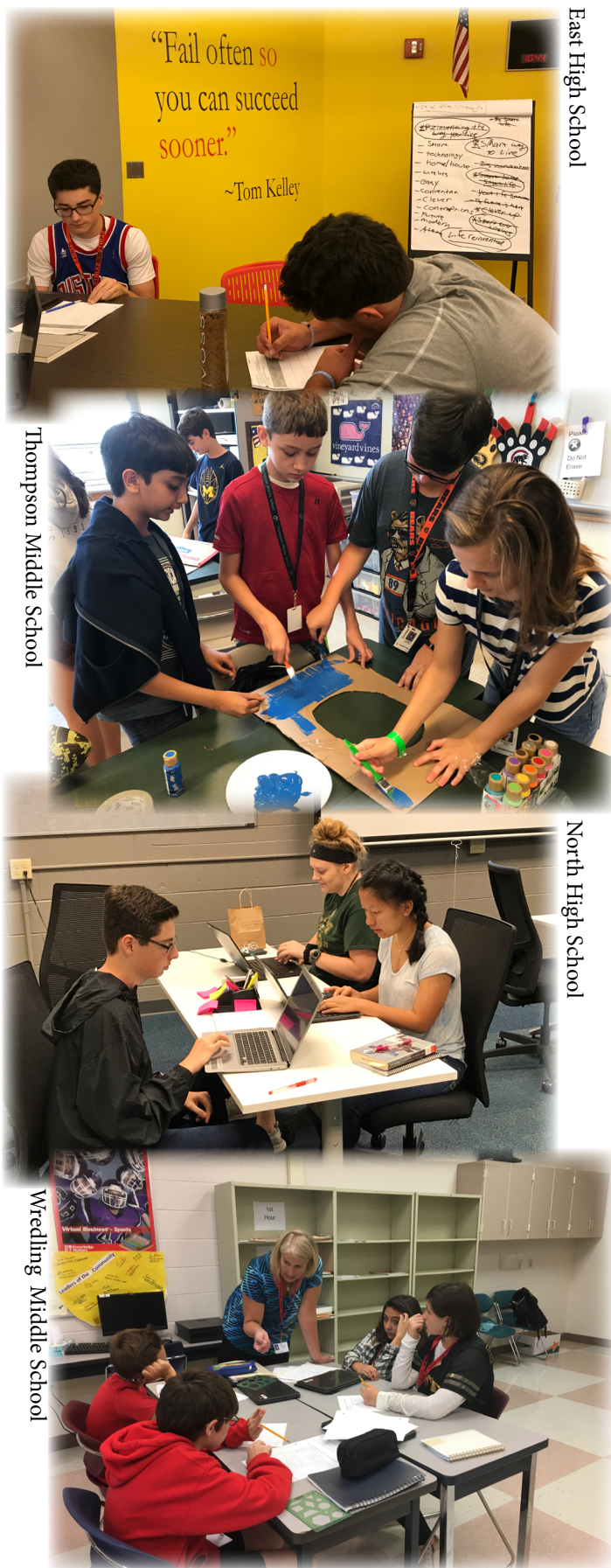
East High School

Coaches and mentors from the community are visiting classes on a weekly basis and working with students on real world skills they can use as they develop their products or services they will “pitch” to a panel of judges in the spring.