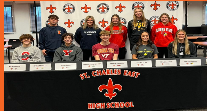
College Signing Day