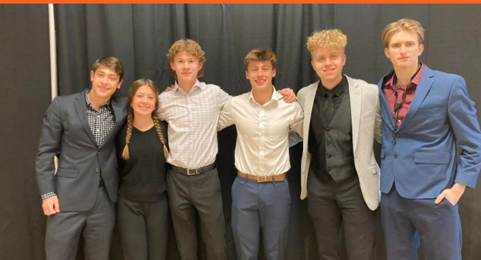
ILMEA Jazz Band (L) and Vocal Jazz (R) at STCE on Nov. 4