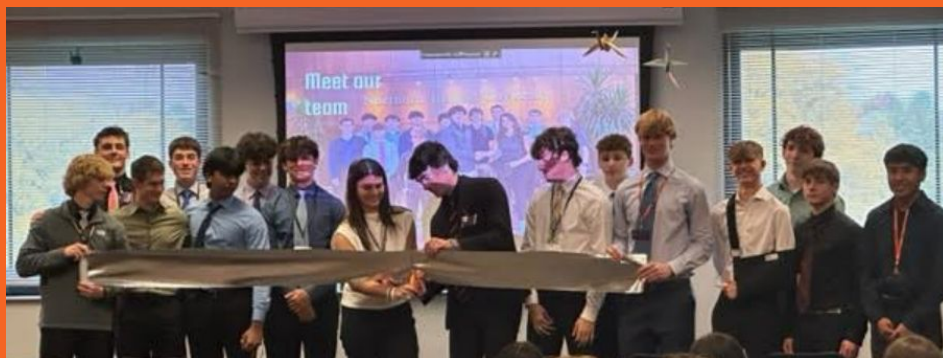
VEI Ribbon Cutting Ceremony