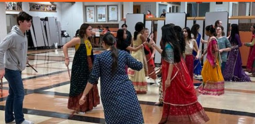
STCE South Asian Student Association Hosts Garba Event