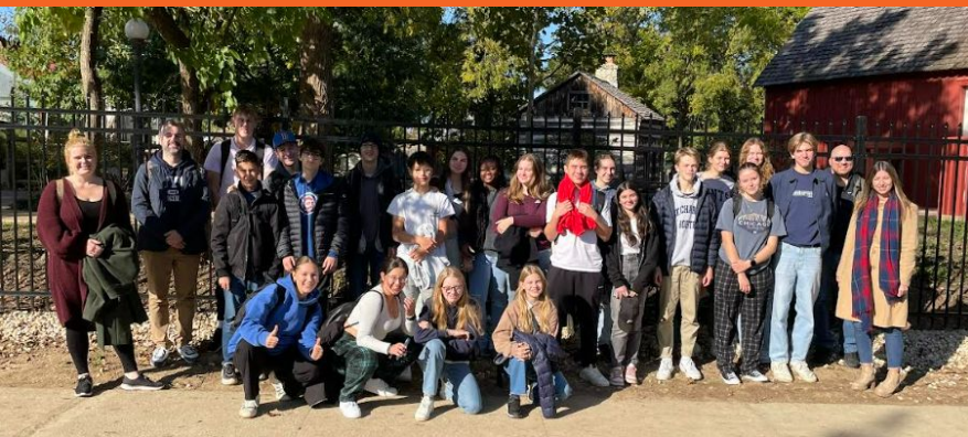
German Exchange Students on a Trip to Naper Settlement