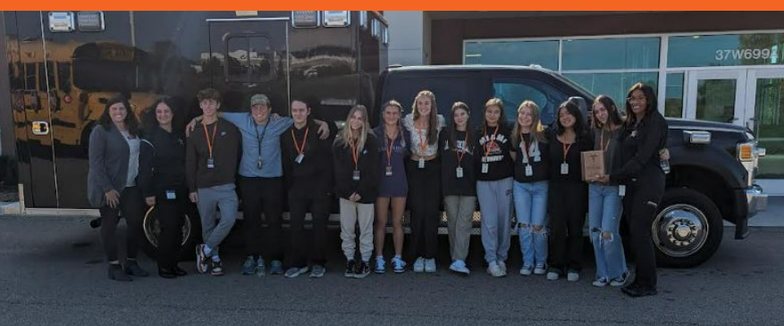
Advanced Healthcare Concepts Students on a Field Trip to the Kane County Coroner's Office