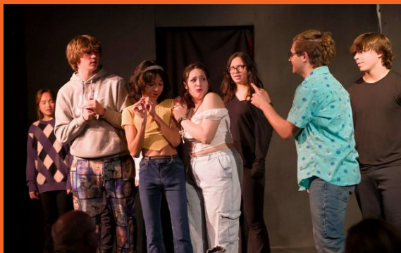
Student-Directed One Acts