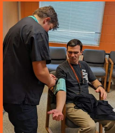
Advanced Healthcare Concepts Students Practice Taking Vital Signs