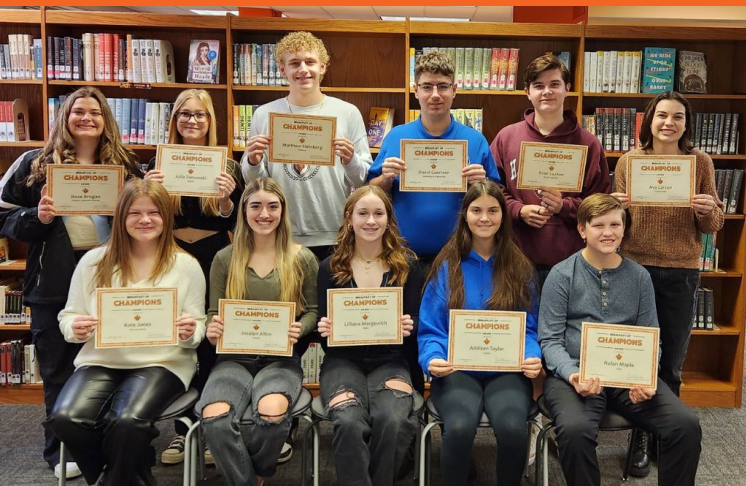
Nov. (R) and Dec. (L) Breakfast of Champions Recipients