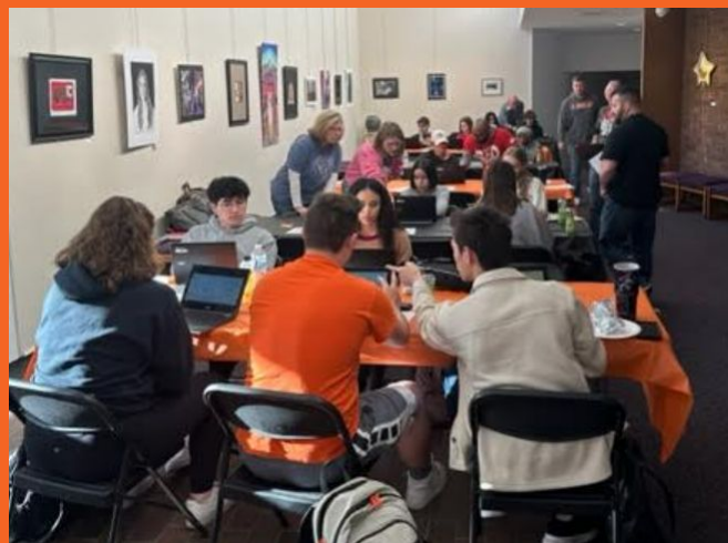
Celebratory Breakfast for our Mid-Year Graduates